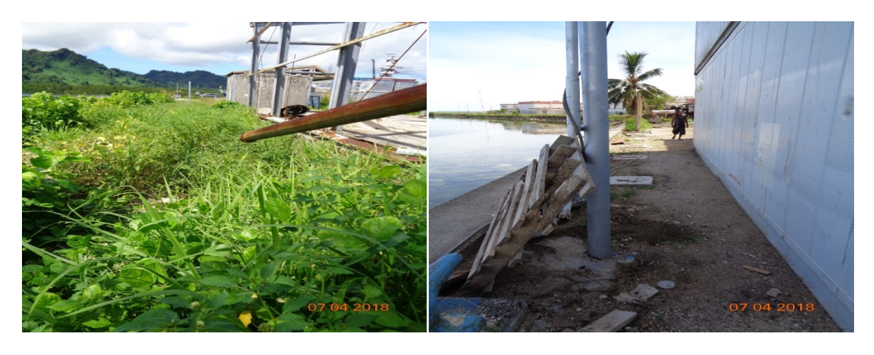
Grass overtaking fence line on east side of dock fence post bases on the west side of the dock