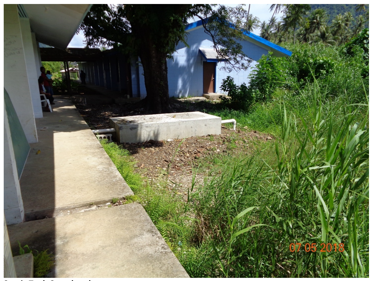
Septic Tank Completed