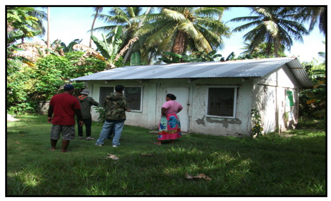
Geotechnical Survey Team examining one of the sites of the Dispensaries

from the PMU and USACE, will undertake the constructability and biddability reviews as soon as the bidding documents are ready.