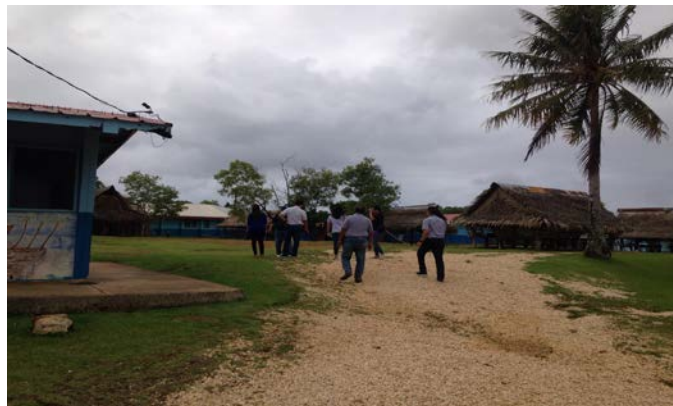
Preliminary Site Inspection with prospective winning bidder

YPMO staff with the prospective winning bidders conducted a preliminary site investigation and assessment at Yap High School.