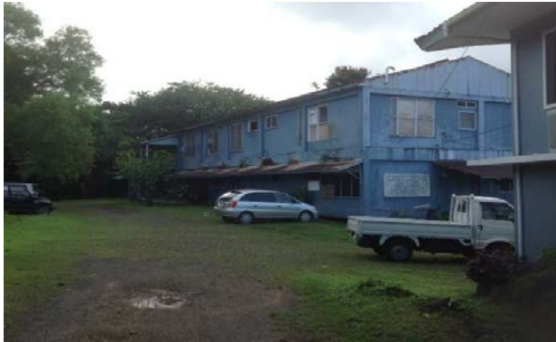
COM Demolition Site before

The demolition works started on December 15 th , 2018 and were completed on schedule by March 15 th , 2019.