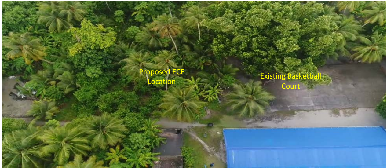
Existing Site Conditions Aerial Shots