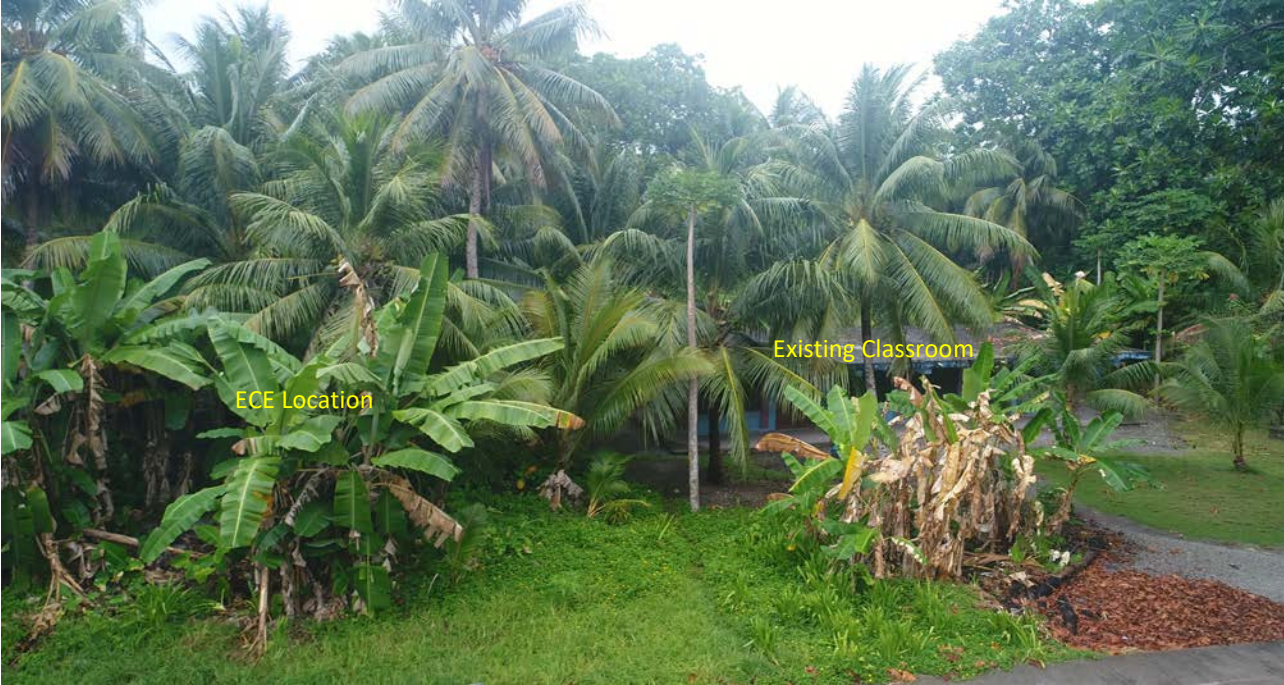
Existing Site Conditions Aerial Shots