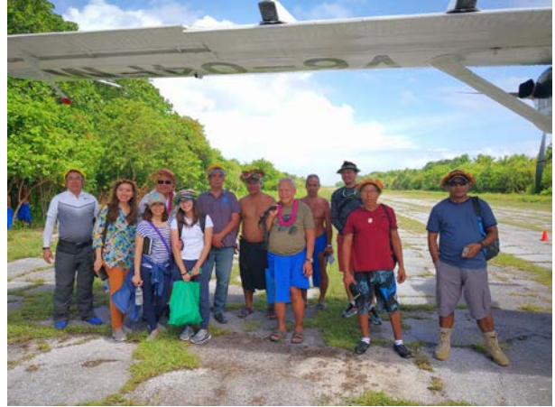
Site Inspection at Woleai High School