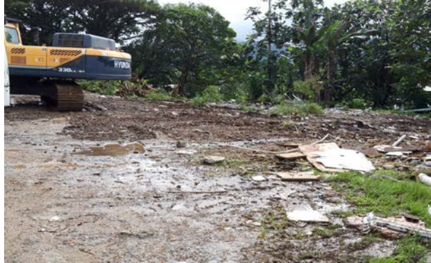
COM Demolition Site After