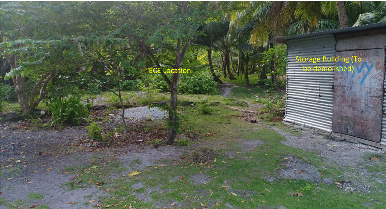
Existing Site Conditions Aerial Shots