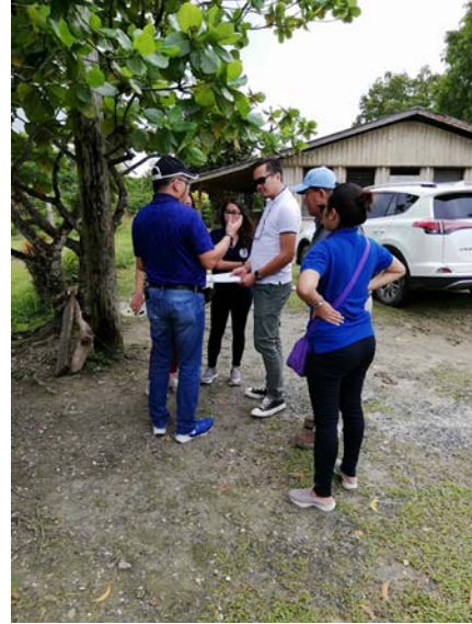
Site Inspection at Colonia Middle School