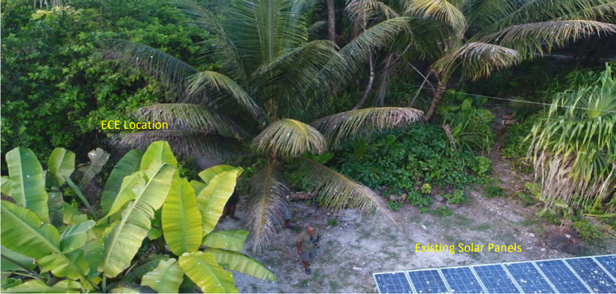
Existing Site Conditions Aerial Shots