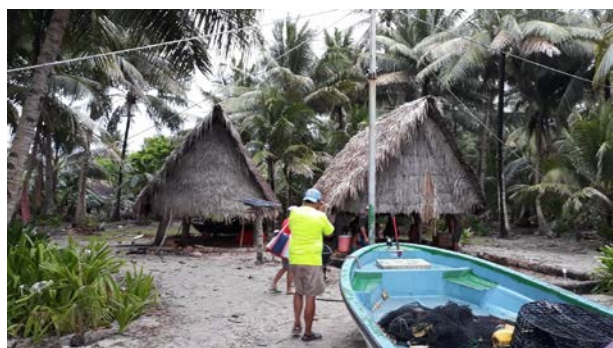
Site Inspection on Various Outer Island ECE Sites