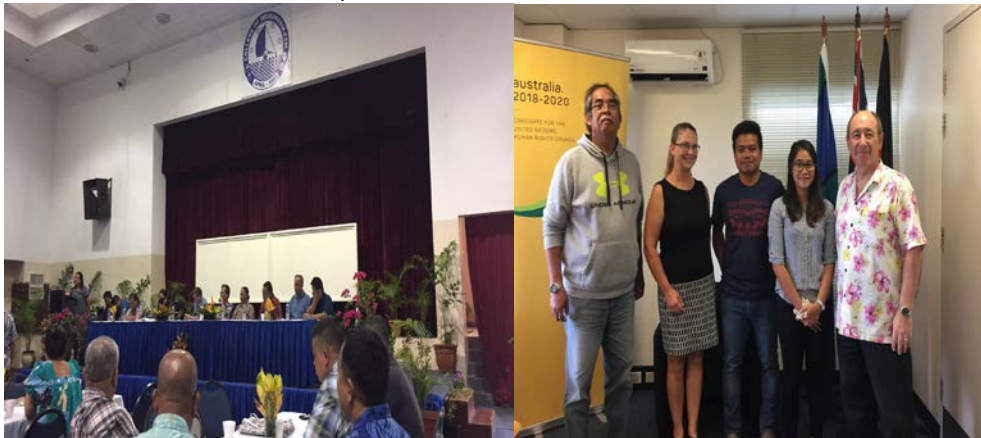
Budget Consultation and Conference