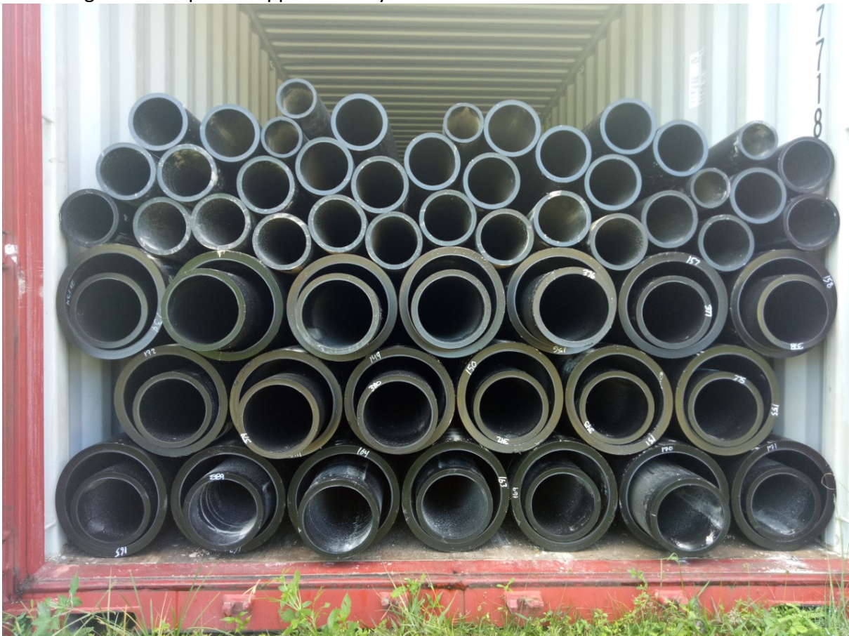
Pipe materials for Sekere Waterline Project

Percentage Time Elapsed is approximately 32.67%.