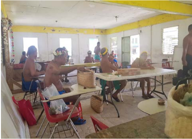
Meeting with Woleai Chiefs and WHS Faculty Staff

PMO staff carried out a site visit at the site at Woleai Atoll with the prospective winning A&E bidder for a preliminary site assessment and evaluation on January 13, 2019. The team made a presentation and met with the chiefs of Woleai and WHS faculty staff.