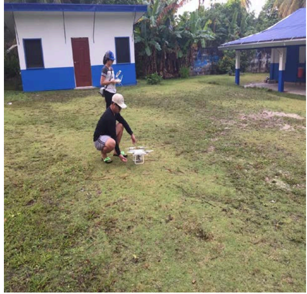
Site Inspection on Various Outer Island ECE Sites