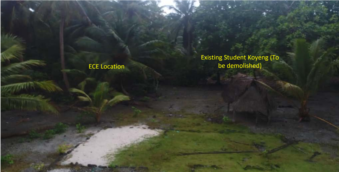
Existing Site Conditions Aerial Shots