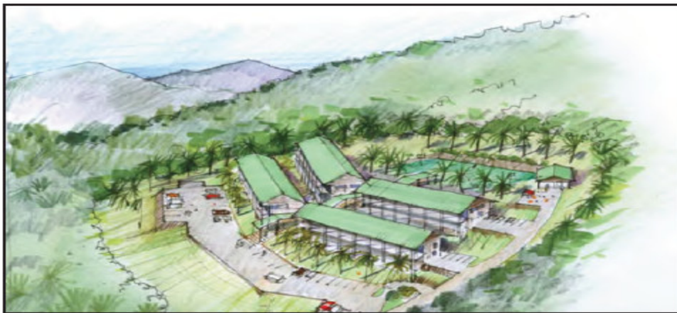
Artist's rendition of proposed campus at Nantaku Site. By Beca International Consultants Ltd.

The Masterplan for the Chuuk State Campus was prepared by Beca International Consultants of