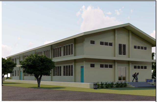
Perspective of New Teaching Clinic