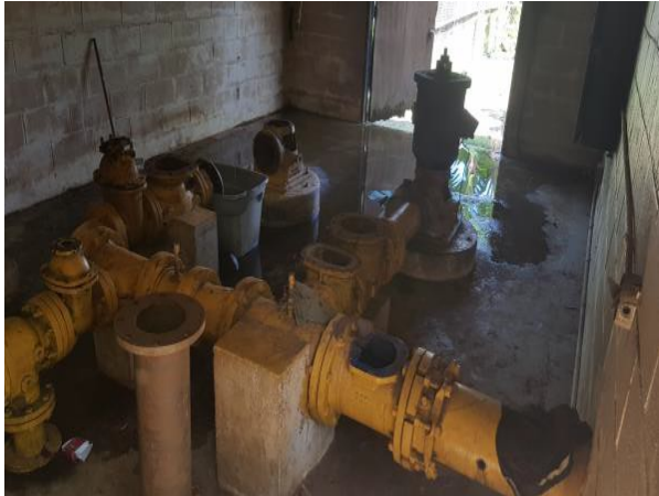
Pump House dysfunctional Jan 2018