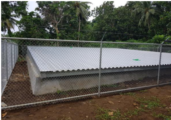
Upper Reservoir Completed Oct 2018