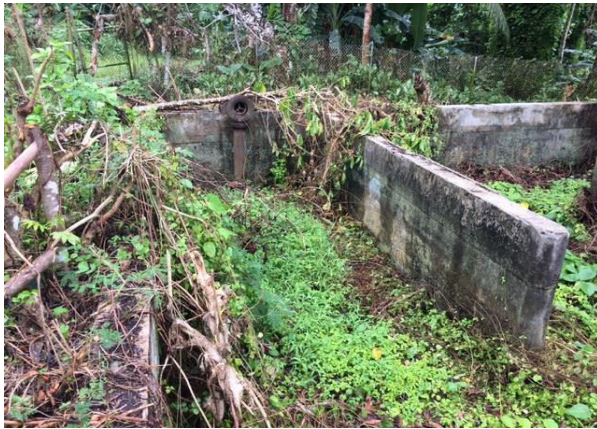
Abandoned Water Treatment Plant (Jan 2018)