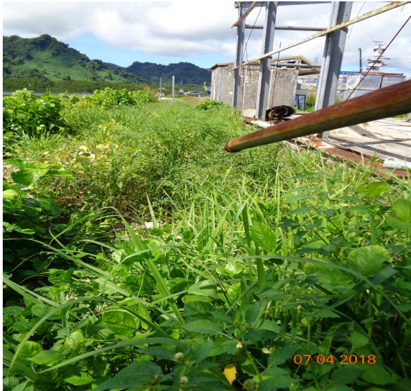
Grass overtaking East line of Dock