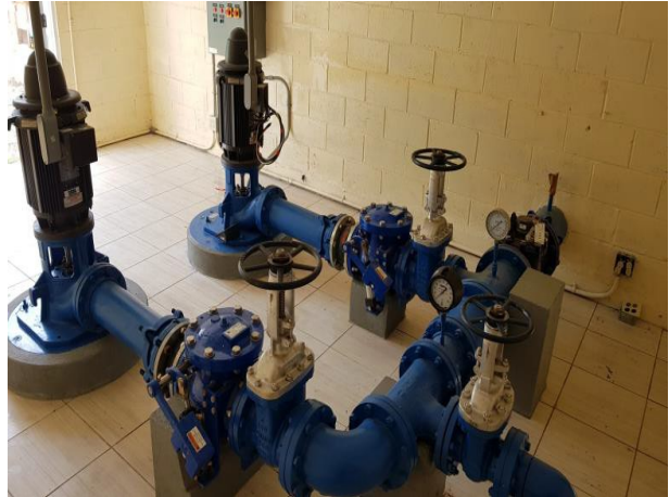
Pump House with new pumps, pipes and valves