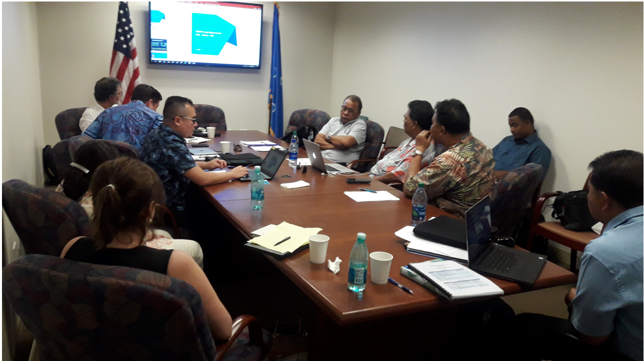
Participants at the Honolulu Meeting on the Chuuk State Hospital Project