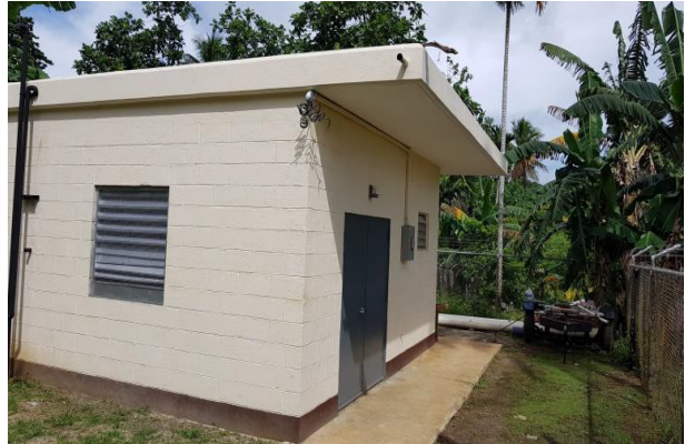
Generator building Nov 2018