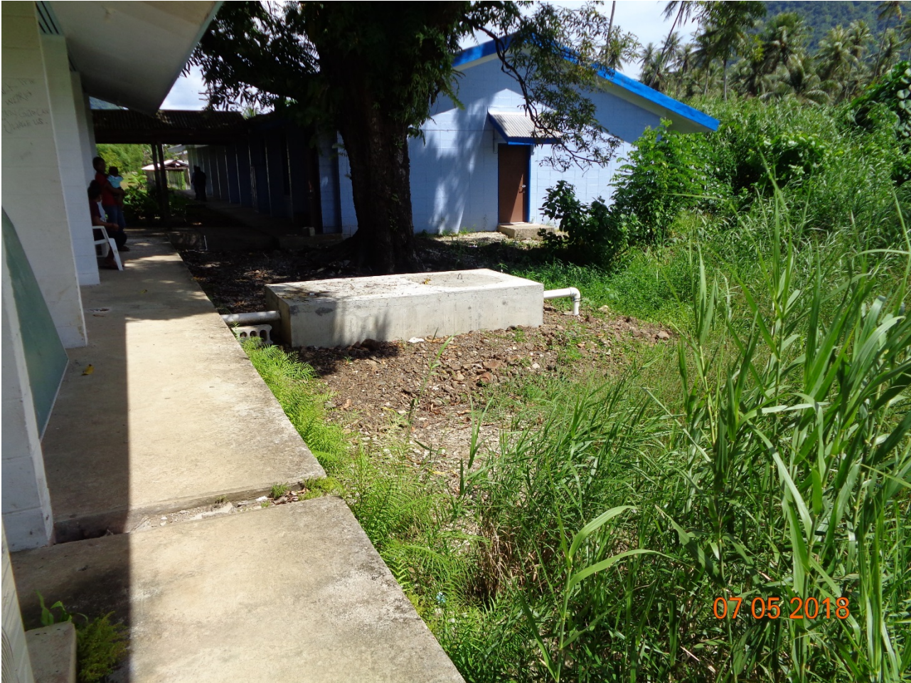
Septic Tank Completed

The project was completed and final acceptance was achieved on May 9 th . The final payment has been made and the contract is closed. The project will be monitored over the next year for warranty defects.