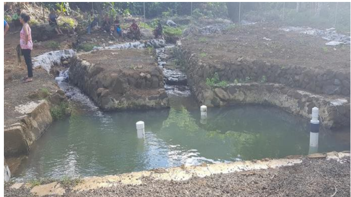
Rehabilitated Fans inifo Intake

Two raw water intakes are designed to supply run-off water to the WTP. For the purpose of the rehabilitation only the Fansinifo intake was used. Work here included clearance of tons of silt, improvements to the roughing filter gallery, fencing, and retaining wall repairs to stop water by-pass. As a result, the flow to the WTP from this intake has increased significantly.