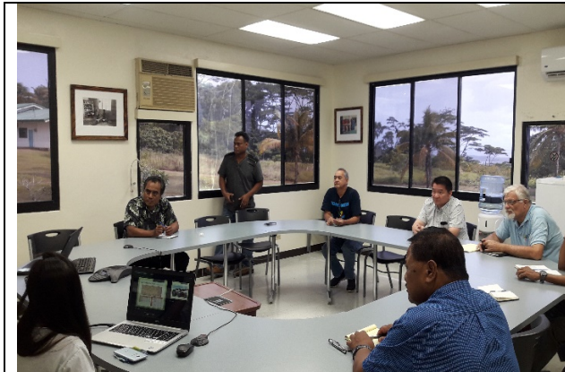
Presentation of Conceptual Designs to Stakeholders

Conceptual designs for the new teaching clinic at the National Campus are now being developed by the PMU and COM, with the kind assistance of the Yap State PMO Office. The two Architects from the Yap PMO Office visited Pohnpei during the week of June 9-15, 2019 to undertake the field work and consultations for the development of the conceptual designs. A number of design options have been prepared and these were presented to a joint meeting of the PMU and COM on June 14 th , 2019. However, due to the cost of the proposed designs, PMU and COM requested that the Architects reduce the design footprint. The process to prepare a revised conceptual design is now on-going and is expected to be completed by the end of July, 2019. Once the conceptual designs are prepared and endorsed by all parties, the PMU will prepare and RFP for the provision of detailed design services.