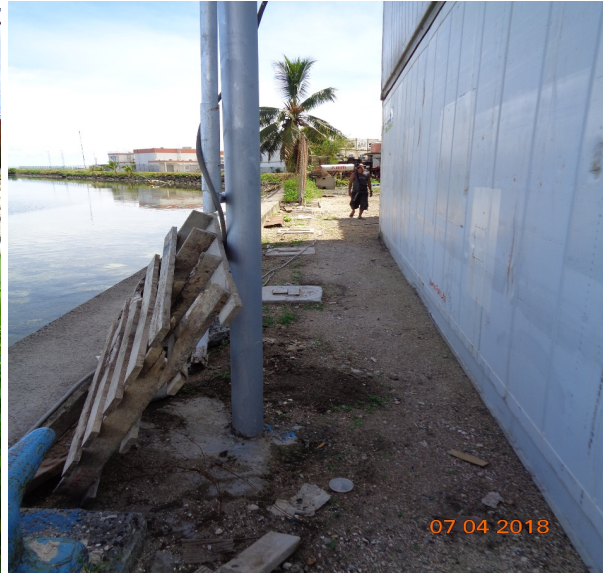
recently constructed fence post base