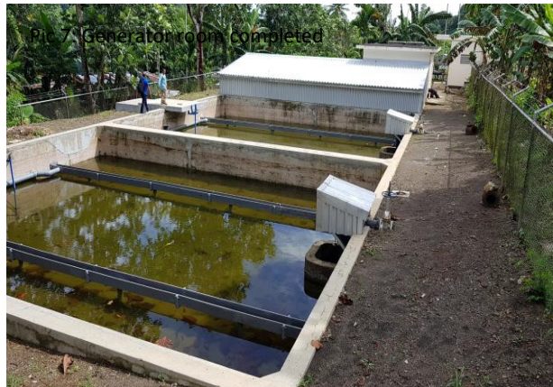
Rehabilitated WTP (Nov 2018)