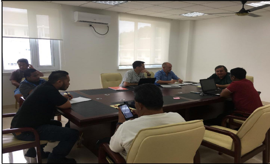
Meeting Between PMO and BECA Consultants