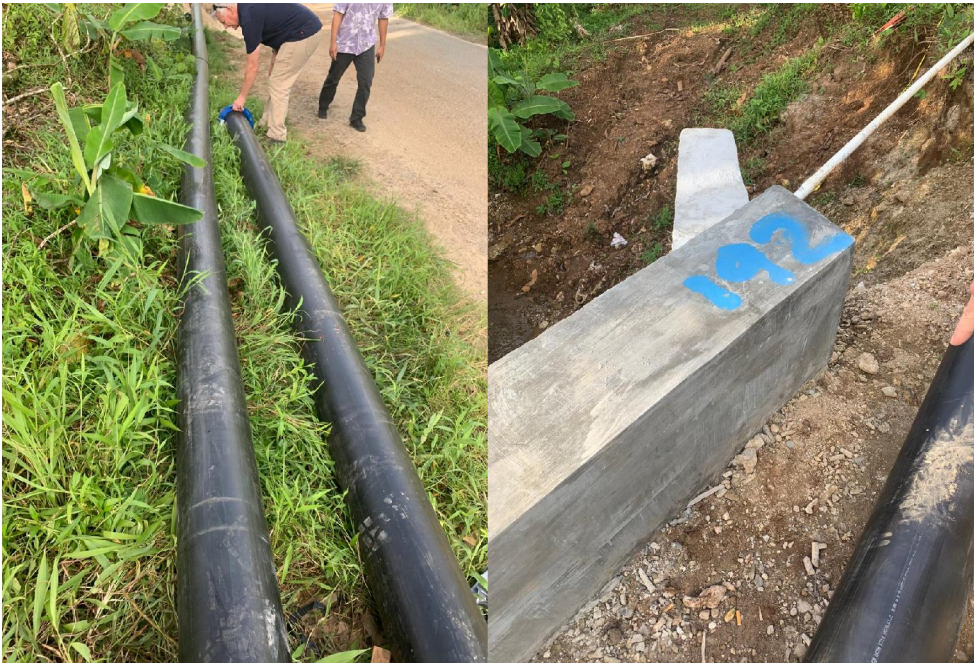
Pipe installation work in progress during USACE/PMU visit

Percentage Time Elapsed is approximately 63.38%. Contractor will be advised to seek a time extension on the contract.