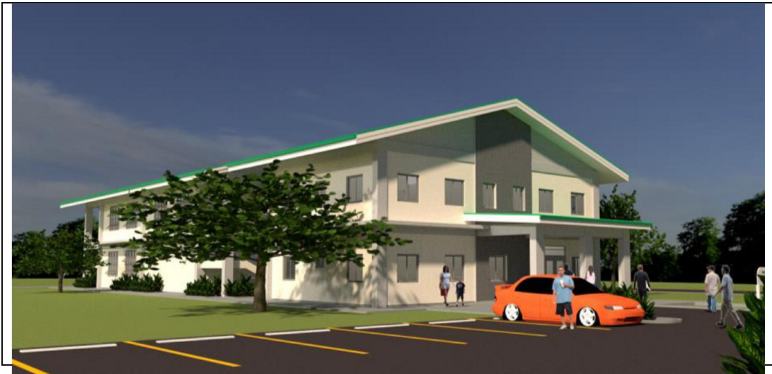
Perspective of New Teaching Clinic – COM Campus