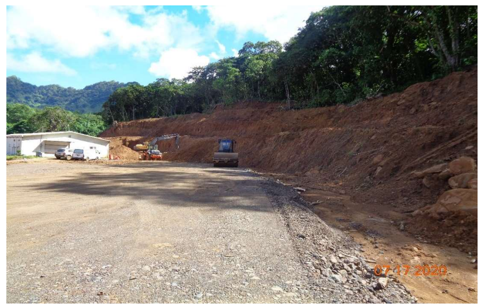
Site Preparation Lower Level