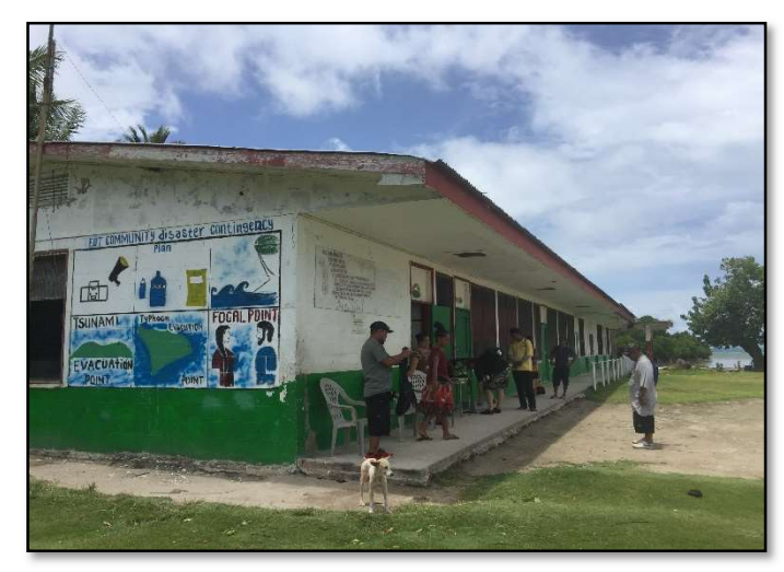
SOUTH EAST VIEW