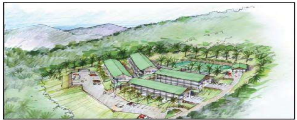
Artist's rendition of proposed campus at Nantaku Site. By Beca International Consultants Ltd.

To supplement the cost of the Project, the Chuuk State Government authorized a funding of $3 million in September, 2016 from Chuuk State Compact Public Sector Infrastructure Sector funds. The FSM Congress also appropriated $1.38 million for the design of the first two buildings and related infrastructure of the project, from FSM National Government carryover Compact infrastructure funds.