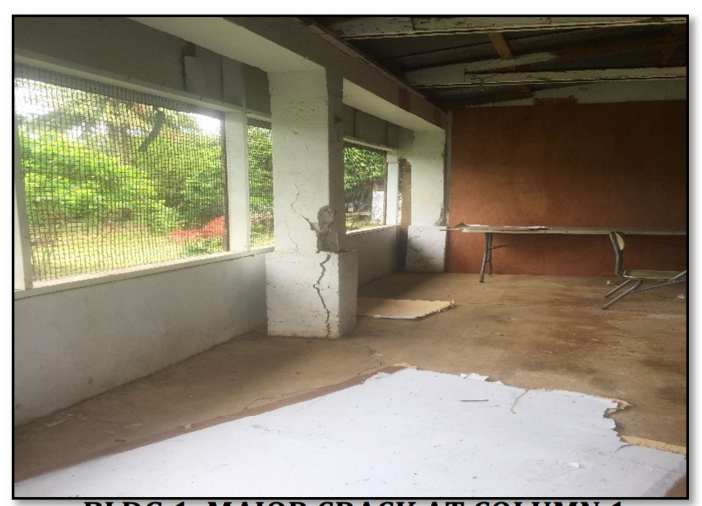
BLDG 1: MAJOR CRACK AT COLUMN 1