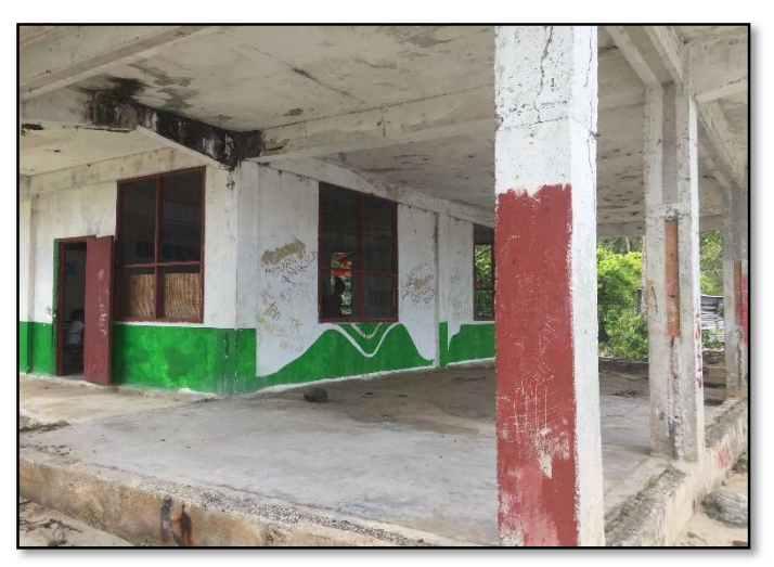
BLDG 1: MAJOR CRACK AT COLUMN 1