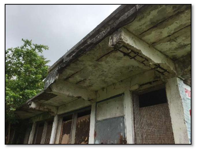
CONCRETE SPALLING AT BLDG 2

Inaka Elementary School is part of the Infrastructure Maintenance Fund (IMF)project list. PMO conducted a brief site visit recommends the existing facilities be demolished and replaced. Foundation settling and numerous cracks in structural elements were observed.