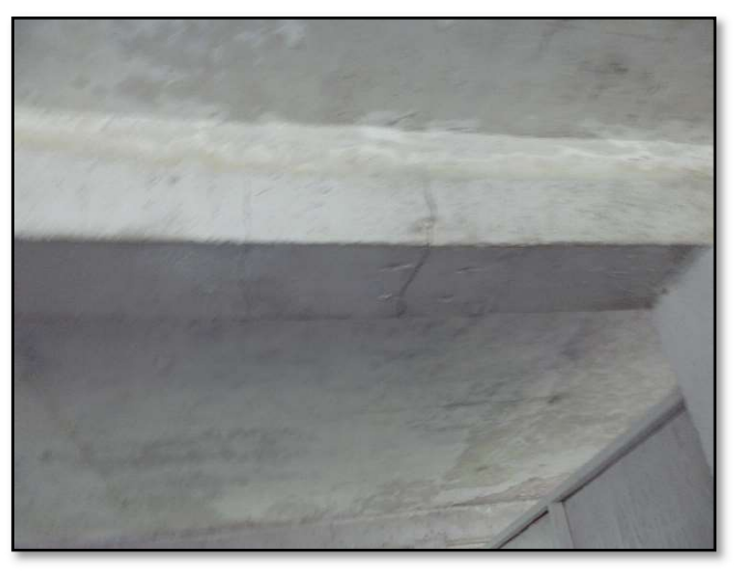
TENSION CRACK ON BEAM AT BLDG 1