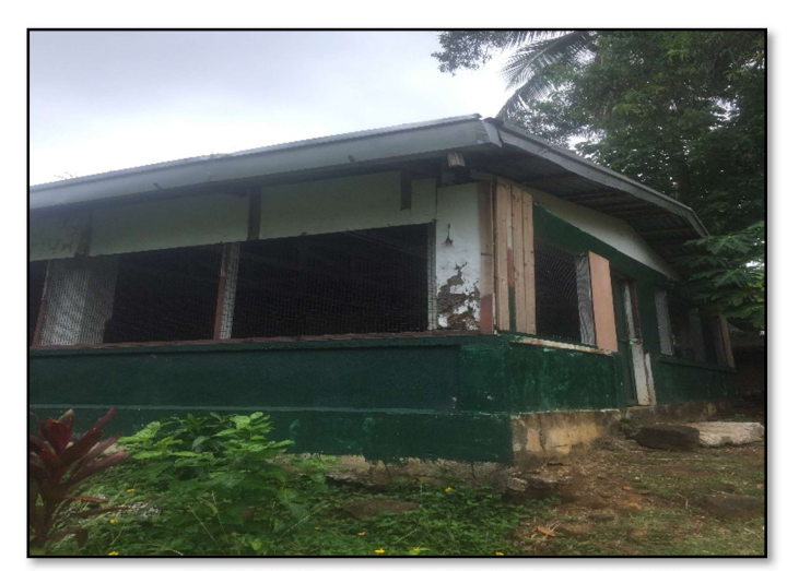
BUILDING 1 SOUTH WEST VIEW