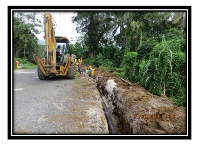
Water Storage Tank Site: