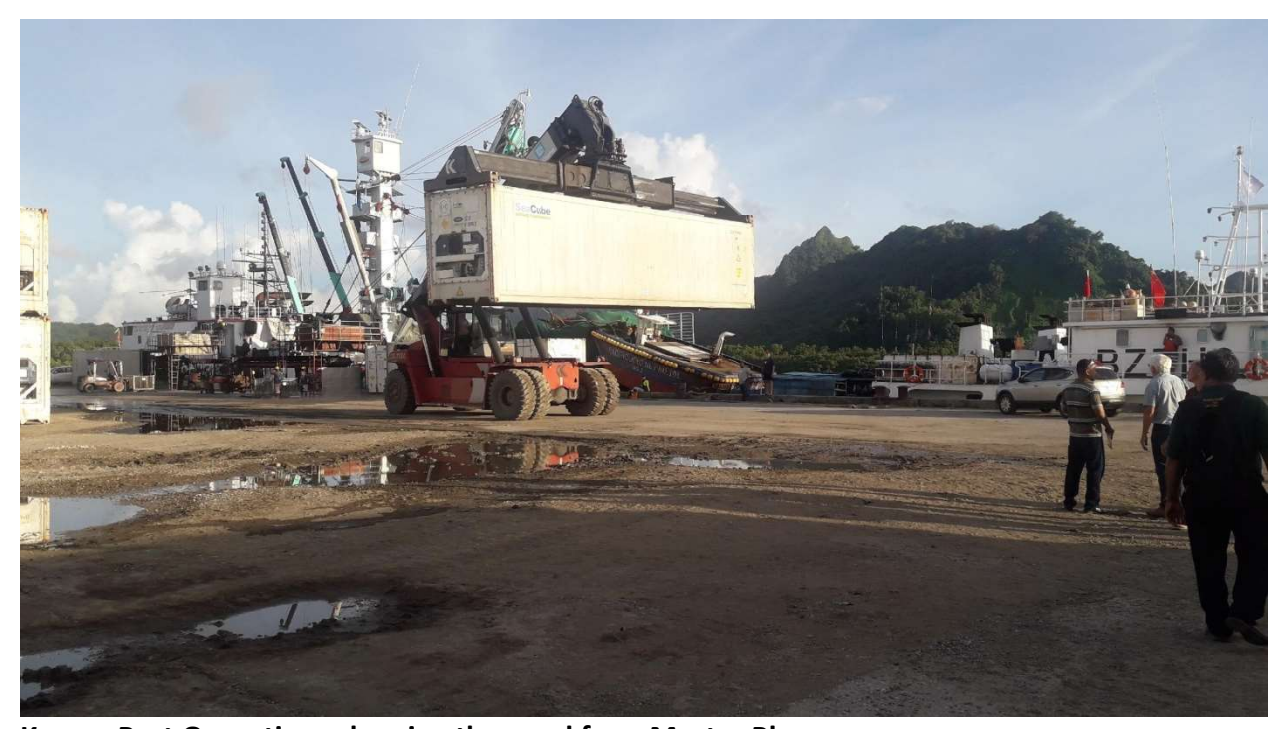
Kosrae Port Operations showing the need for a Master Plan

The draft report received and approved with comments and final report was received and approved on January 5, 2020. The contract can now be closed. KPA is considering a feasibility study for additional container space construction as a follow up project. The Master Plan Gap Analysis will be used to support the design and implementation of the World Bank-funded FSM Maritime Investment Project.