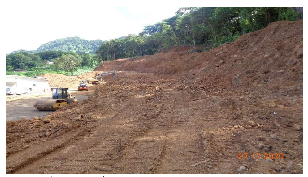
Site Preparation Upper Level