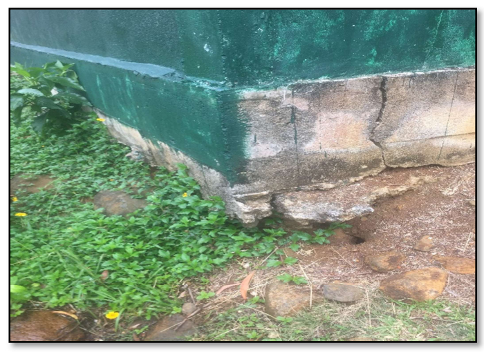
BLDG 1: FOUNDATION FLEXURAL CRACK