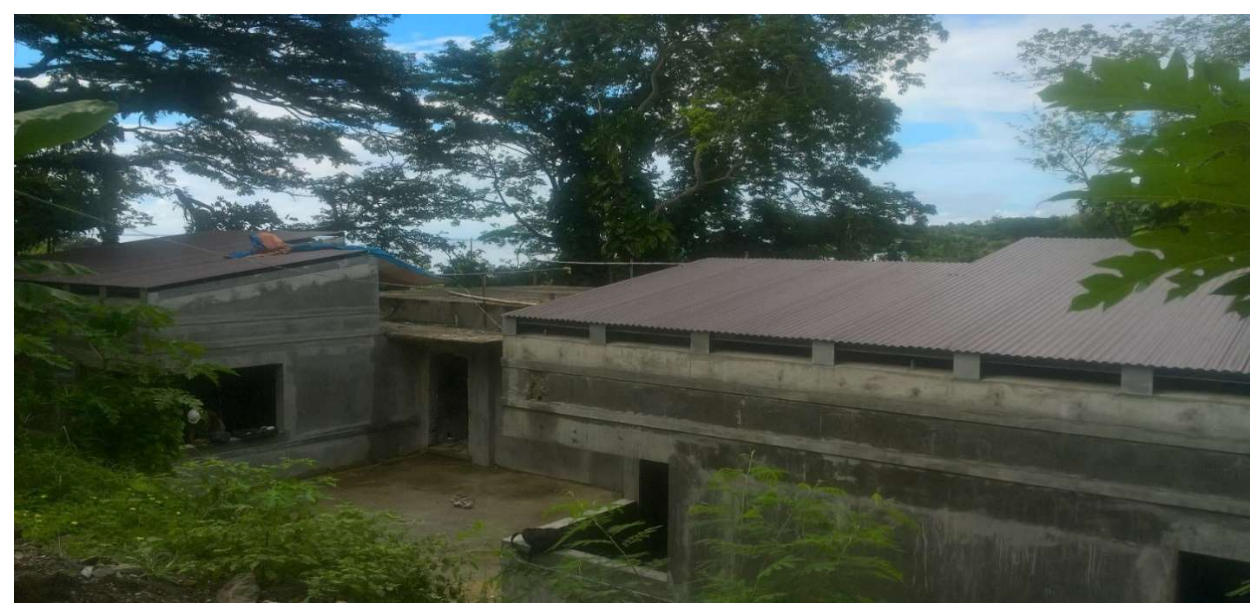
Colonia Wellness Center Project – 58 % completion as of June 30, 2020