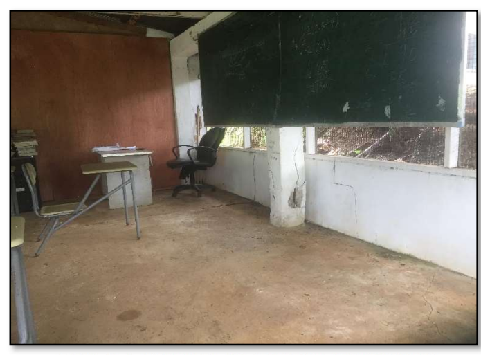
BLDG 1: MAJOR CRACK AT COLUMN 2